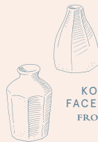
KOHIKI FACET VASE FROM 98