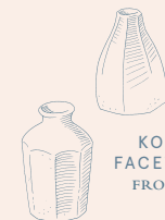
KOHIKI FACET VASE FROM 98